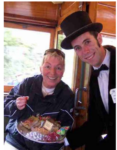
(Curly's Diary... continued on page 8)

People around gave us a smile in great pain because it was a torture for them.