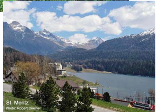
St. Moritz