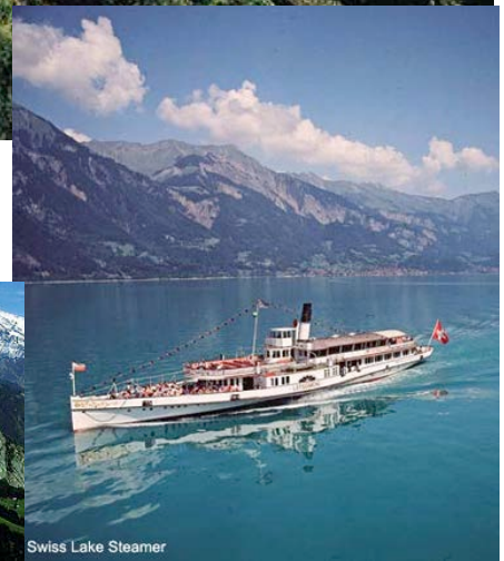
Swiss Lake Steamer