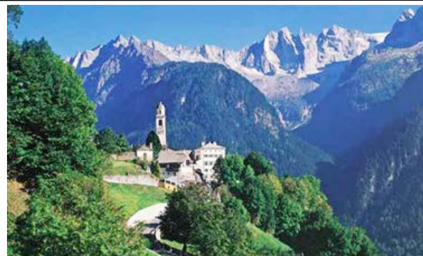
Postal Bus Route