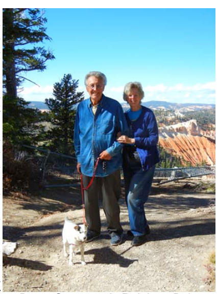
Bryce Canyon - At Rainbow Point (elevation 9115')

That night, and the day while next driving through the Grand Staircase-Escalante National Monument and then Bryce Canyon, it was very windy. The next night in Panquitch, UT, we learned (now that we had a good wifi connection) that one of my colleagues during m y assignment in Laos and who was at the Reunion with is wife had been killed in a head-on cross-over auto accident on I-40 while returning home