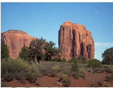
The "Elephant" in Monument Valley

Well, it didn't just get down to the predicted 32° last night ... it got to 23°!!! Yikes! This day we drove to the Monument Valley Navajo Tribal Park in Arizona. We got in late and camped at the Goulding's Camp Park across the highway and located in ... Utah! In the morning we then drove the unpaved dirt 17 mile loop in the Park. I must say it was gorgeous; the scenery, NOT the road!