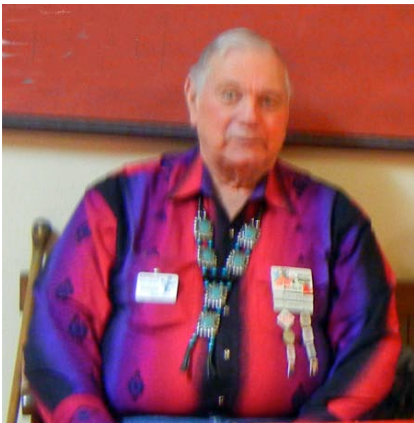
Feb. 2018 Sweetheart Special