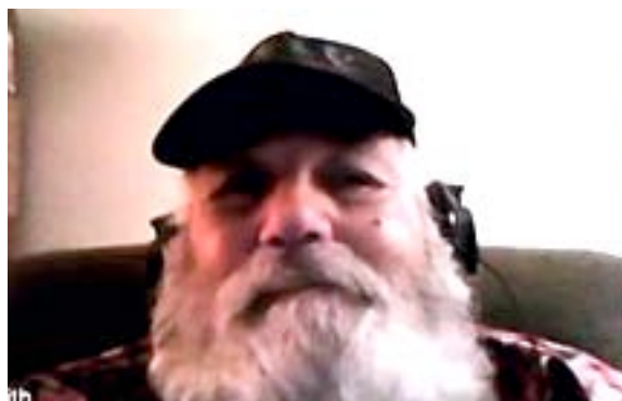
5 March 2021 Zoom while in San Jose