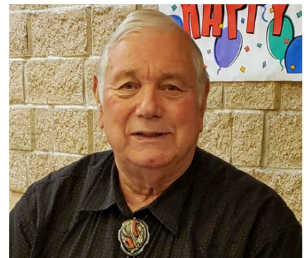
28 Sep 2019 at Tillie's 100th birthday party