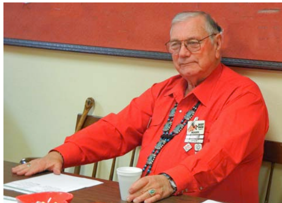
Feb 2016 Sweetheart Special