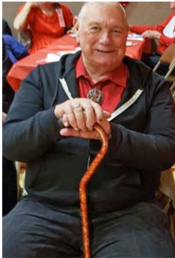
Feb. 2019 Sweetheart Special