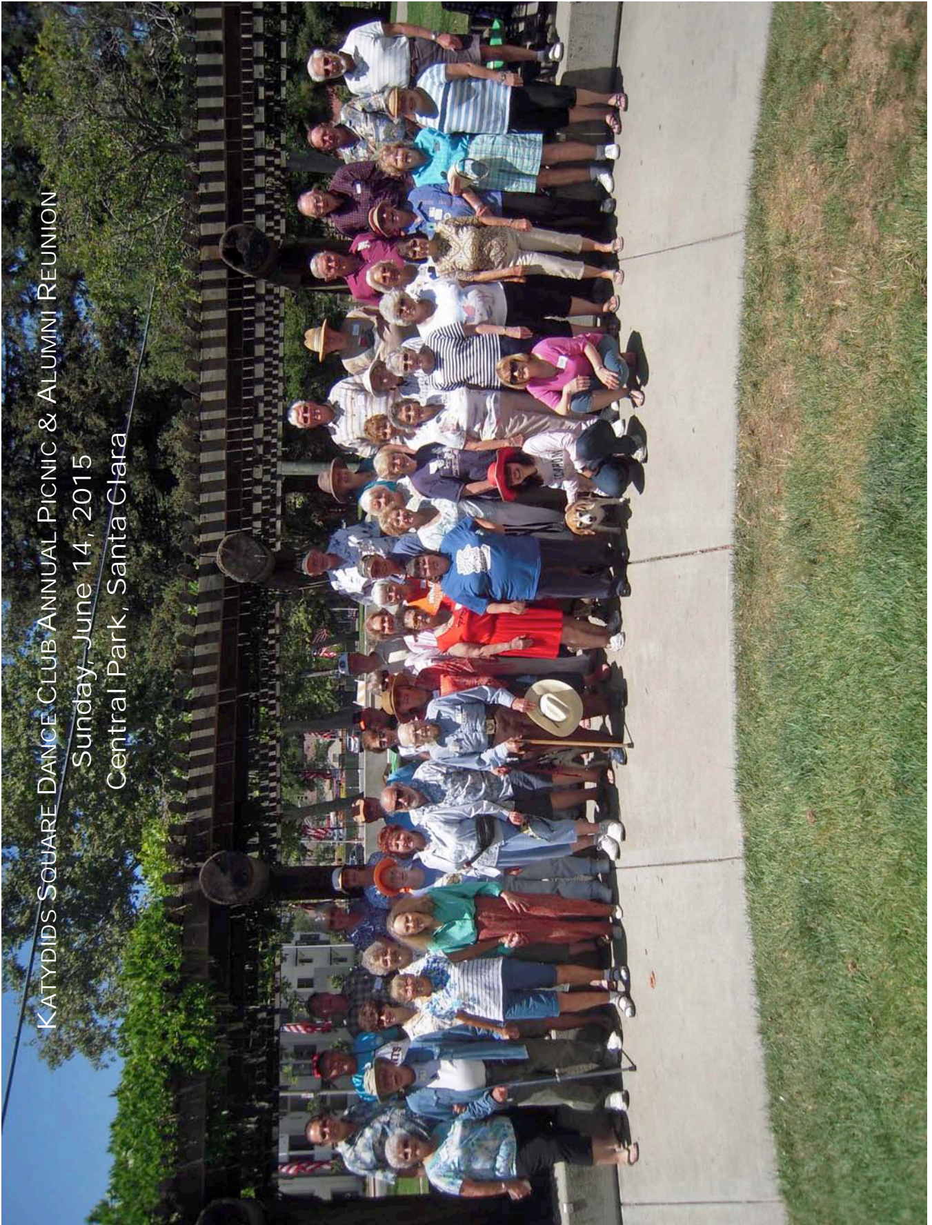
KATYDIDS SQUARE DANCE CLUB ANNUAL PICNIC & ALUMNI REUNION Sunday, June 14, 2015 Central Park, Santa Clara