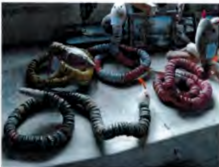
The crafts were simpler, too. These snakes are made from bottle caps.