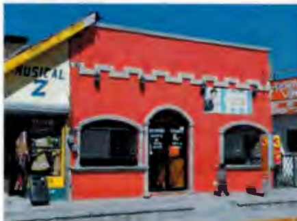
Did I mention it's a very colorful town?