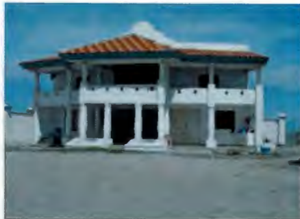
Some of the beachfront homes are mansions