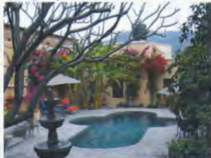
But once inside, the courtyard was exquisite!