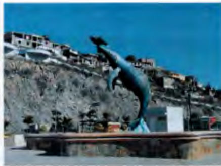
We also found some local art....