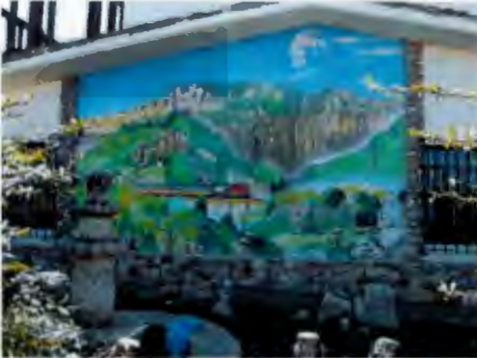
Creel has a wonderful museum – could even make you miss your train if you rely on the published schedule!