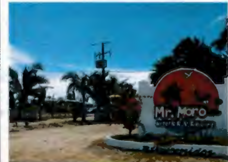
Our southern-most destination.