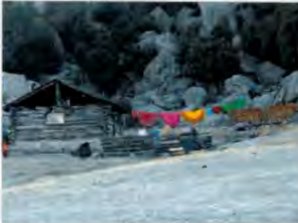
We passed a local Taramahara home, with their colorful laundry was hung out to dry