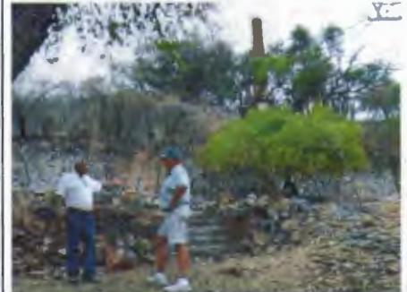
We took a guided tour into the countryside, stopping at an abandoned silver mine. The owners had just walked away – no remediation attempted