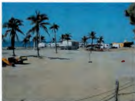
Our campground was well-situated.