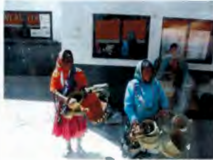
One last view of the Taramahara women.