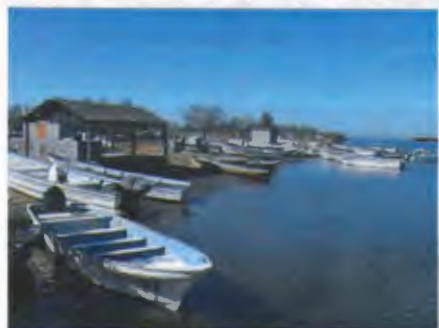
We decided to take one of the yachts to Bird Island.