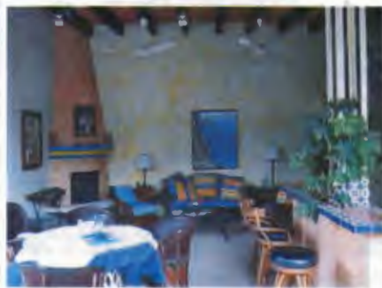
The informal dining area looked pretty plush to us RV'ers.