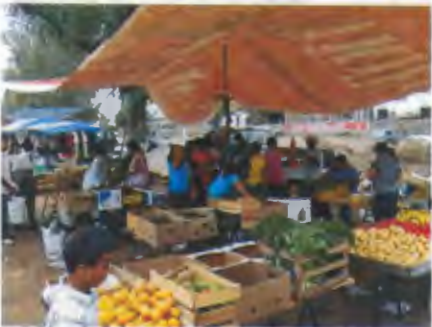
And the local farmers provide plenty of food!