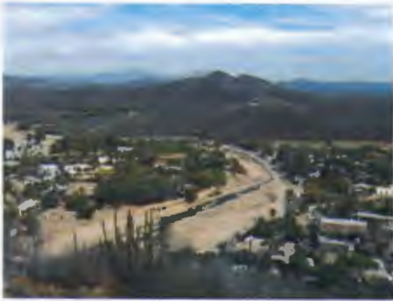
.... and could easily see the path of destruction of flash floods resulting from a Pacific hurricane that hit the area the year before.