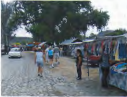
But people persevere! The flood washed away a large market area, yet the vendors returned and began the task of rebuilding