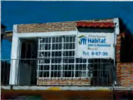
We never know what we'll find in our travels!