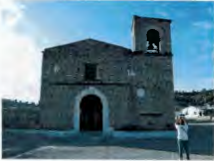
Again, the countryside churches are simpler – but often striking in their simplicity, especially their interiors.