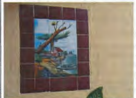
And local art of many styles adorned the home.