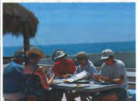
Our traveling companions came out for a visit – in their car!