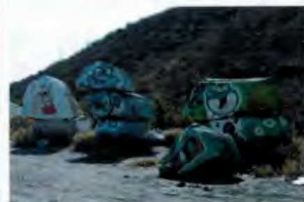
.... and some really local art!