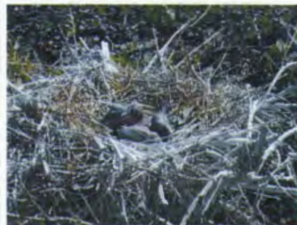
And newborn pelicans in the nest.