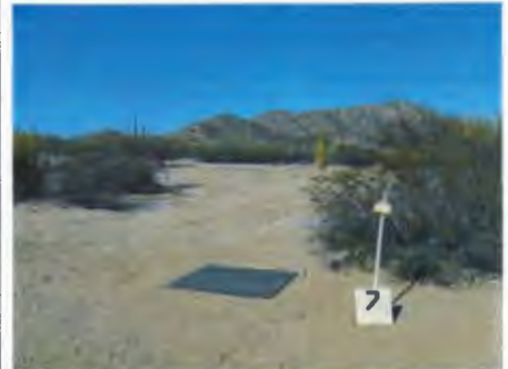
Complete with golf course – desert style