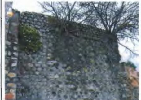
Clearly it had been abandoned for a while!