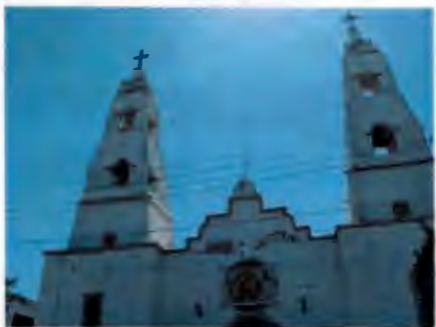
Back to the fancy churches.