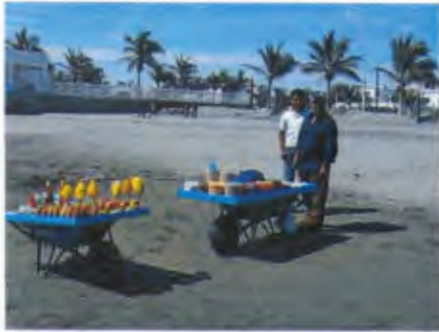
Alternatively, there is "fast food".