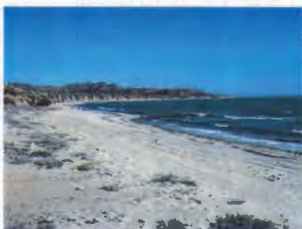
(It was before the new road.) But what a wonderful beach when you get there!