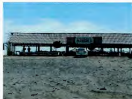
Found this beachfront restaurant...