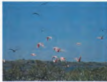
Rosy Spoonbills on the wing.