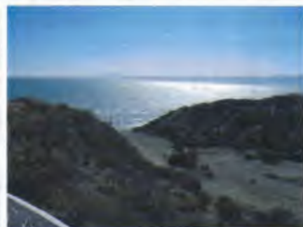
Heading back north we decided to check out the WHR park, Kino Bay. A very exciting entrance drive – 12 miles of soft sand and few directional signs.