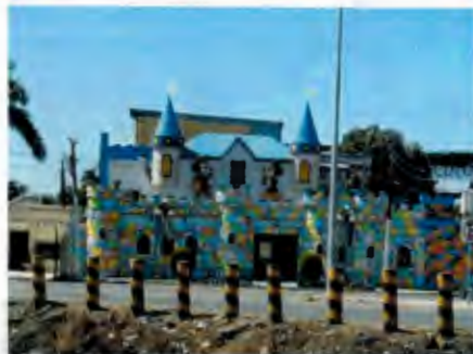
We headed farther south to Huatobampito, passing this school. Looks like fun, doesn't it?