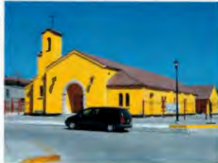
Even the churches get into the act