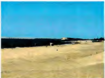
We drove to this beach at Topolabampo