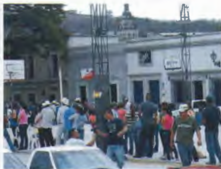
Another sign of civic activities returning to normal was the national election. Here people were standing in line for up to two hours in order to vote.