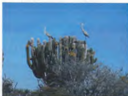
It's got to be a challenge to perch on a cactus!