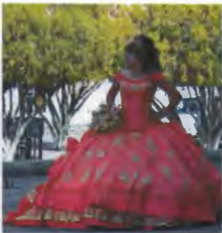
The young ladies sure know how to dress for their Quinceañera party (15 th birthday).