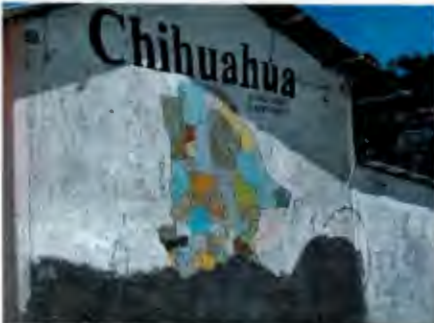
We stayed overnight in Creel, a small, pleasant town that got us into the state of Chihuahua