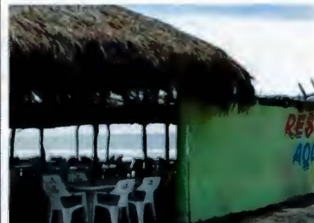
Another of the fantastic beach restaurants, just a pleasant walk from the campground.