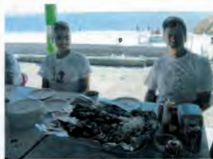
... and enjoyed a feast!