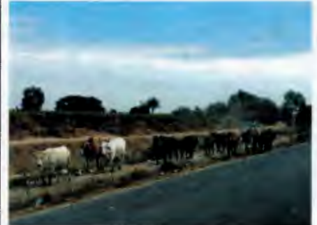
Back on the road – still sharing it – and heading to Las Glorias