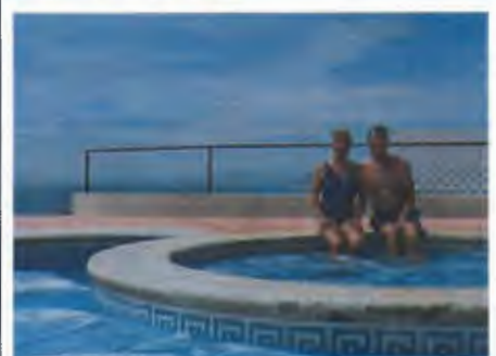
Not many people still in the park – it's early April now – so easy to relax for a few days.