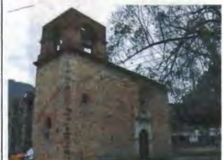
The churches of the countryside are much simpler than their city counterparts.