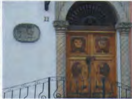
We had an opportunity to tour one of the "apartamentos". Other than the intricately-carved door, the exteriors were pretty drab.