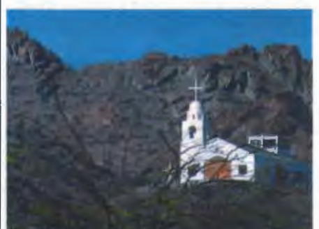
The city of Kino Bay was pleasant with lots of beach area. The mountains were nearby – this church easily visible from town. Not sure how one actually got there! We were warned to get out of town before the Easter crush arrived – or be trapped for a week.