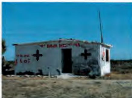
But the local Red Cross building shows wear.