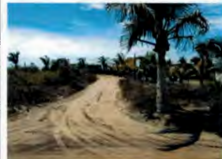
Nothing but the finest roads for our RV's