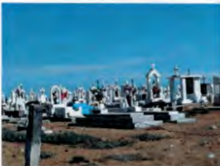
Most Mexican communities had extensively-decorated cemeteries, often with lots of fresh flowers