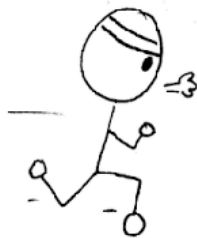
Photo Puzzle Time...

This is a famous maze but there is a NAME and WHERE IS IT? (1/2 point for naming the country).