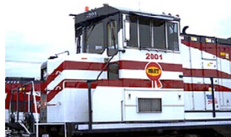
(continued on pg 6)