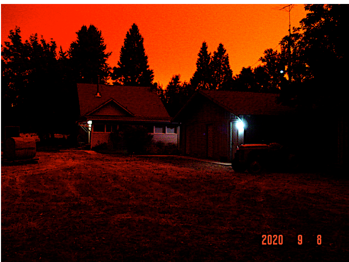
Sept. 8 th : Nighttime at Denis' home

8 Sep: I just took the attached pictures [above]. The smoke is so thick that it is like nighttime. The fire is about 10 miles east of here and there is going to be an east wind today. There is also a new fire that has 101 closed between Hwy 162 (Covelo Road) and Willits. You need to look at the photos on a computer not cell phone. In one you can see the tractor and trailer but if I did not know what I was looking at I would not know what it was. It is really that dark out.