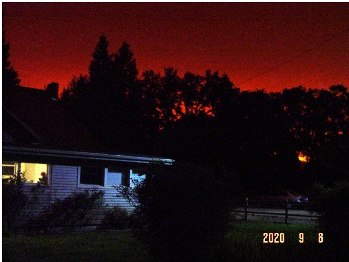
Daytime on Sept. 8 th [ed note: the photo has been lightened!]